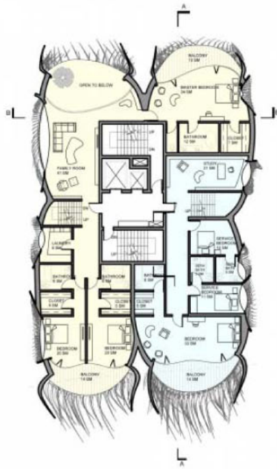
Plan 02