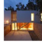
28 Jul 2013 A Suspended Room / NeM Architectes